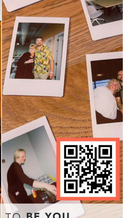
A GREAT PLACE TO BE YOU