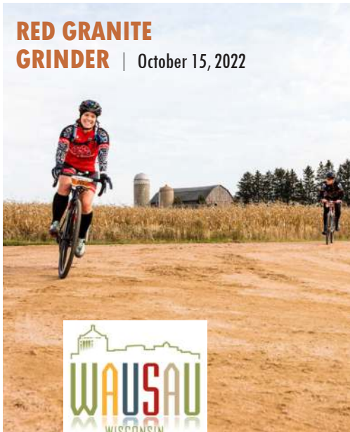
RED GRANITE GRINDER | October 15, 2022