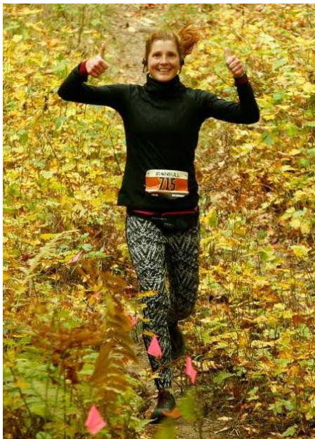
ULTRA TRAIL | October 1, 2022