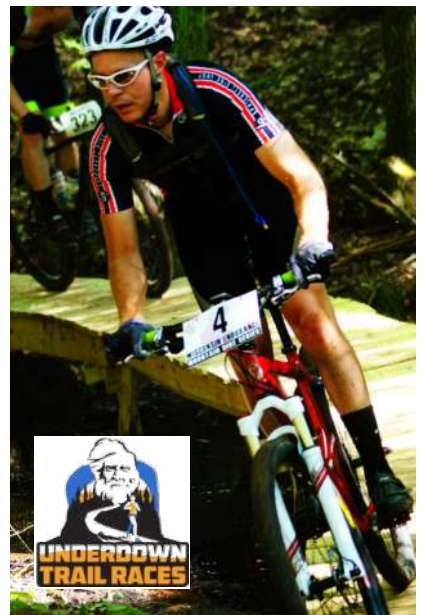
UNDERDOWN TRAIL RUN & BIKE | August 2023

Sponsored in part by the City of Wausau Room Tax