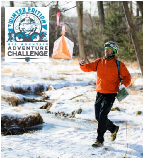
RIB MOUNTAIN ADVENTURE CHALLENGE - WINTER EDITION | January 21, 2023