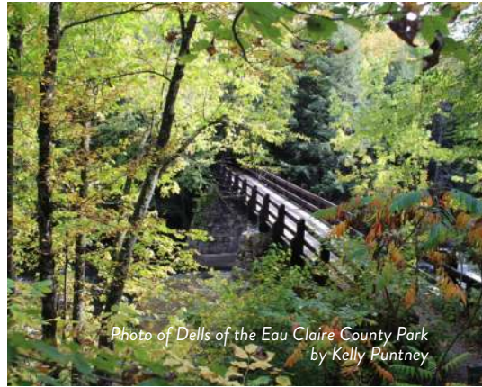
Photo of Dells of the Eau Claire County Park

with organizations such as Central Wisconsin Off-road Cycling Coalition, Nordic Ski Club, Wausau Kayak/Canoe Corporation, Wausau Area Disc Golf Enthusiasts, Wausau Area Pickleball and Wisconsin Woodchucks and more who not only use the City and County facilities but volunteer many hours and donate a great deal of funds to make improvements, making these facilities amazing.”