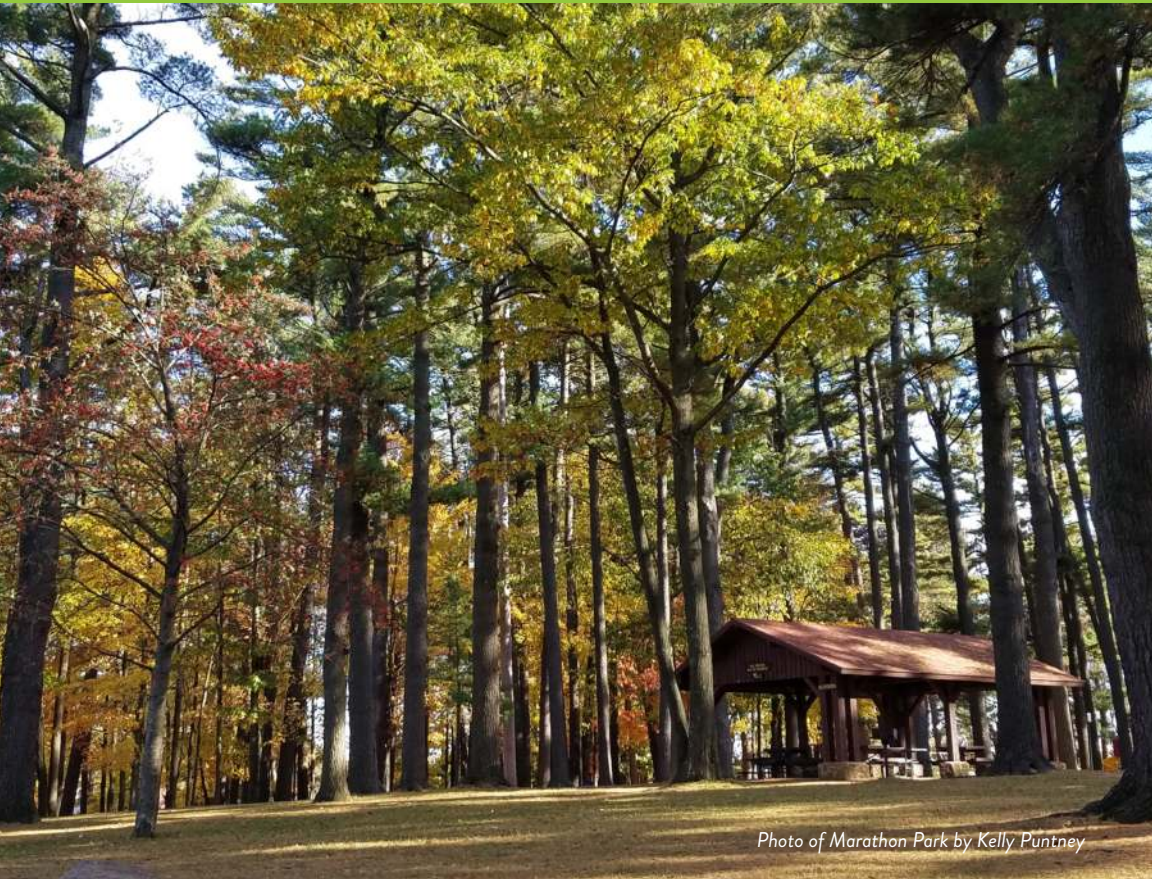
Photo of Marathon Park